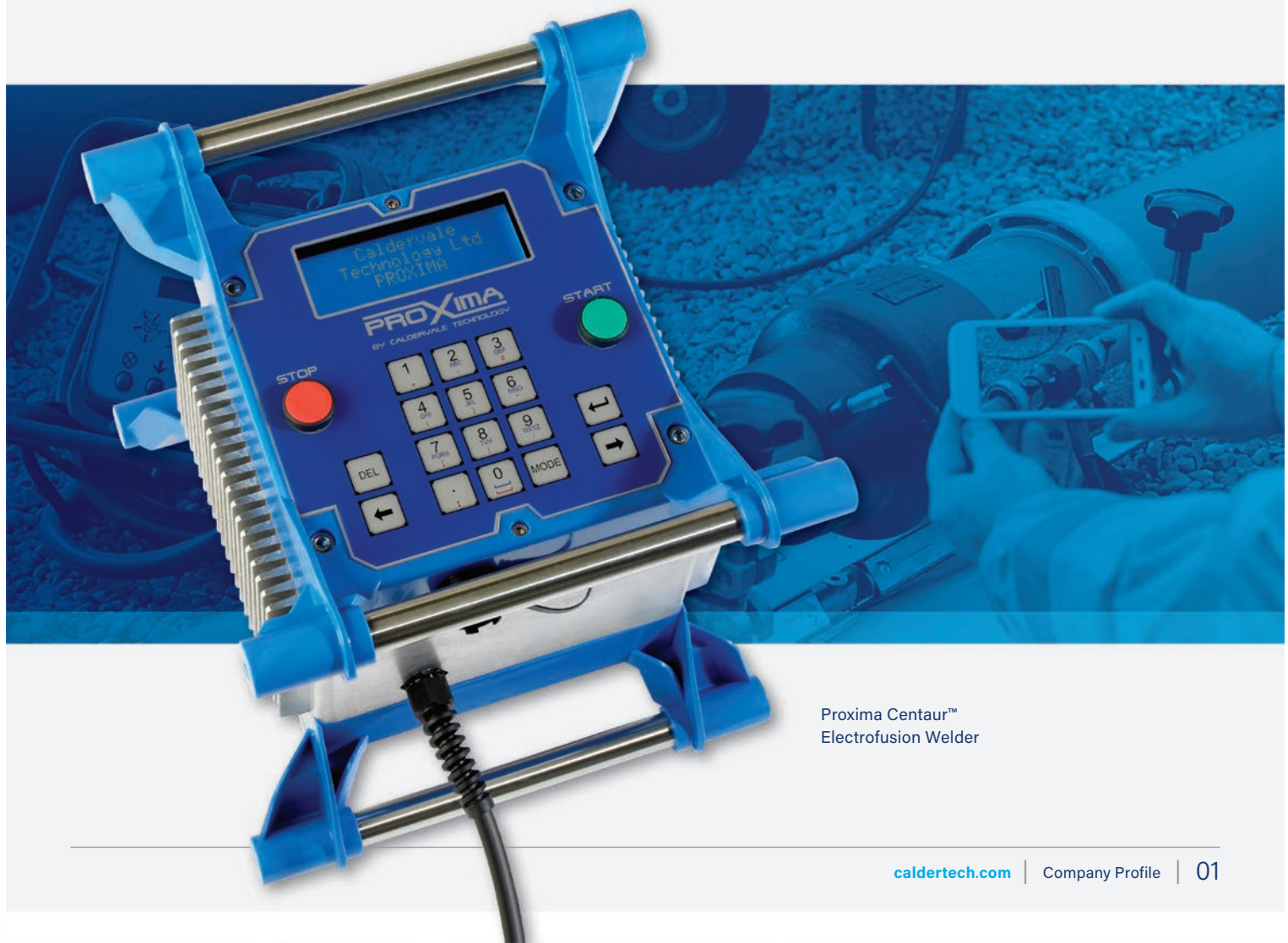
Proxima Centaur™ Electrofusion Welder

Caldertech offers over 200 products for all your butt welding and electrofusion needs. Our core products include butt welding machines and electrofusion control units for connecting HDPE pipes, plus all associated tooling for preparing, clamping and maintaining pipe networks.