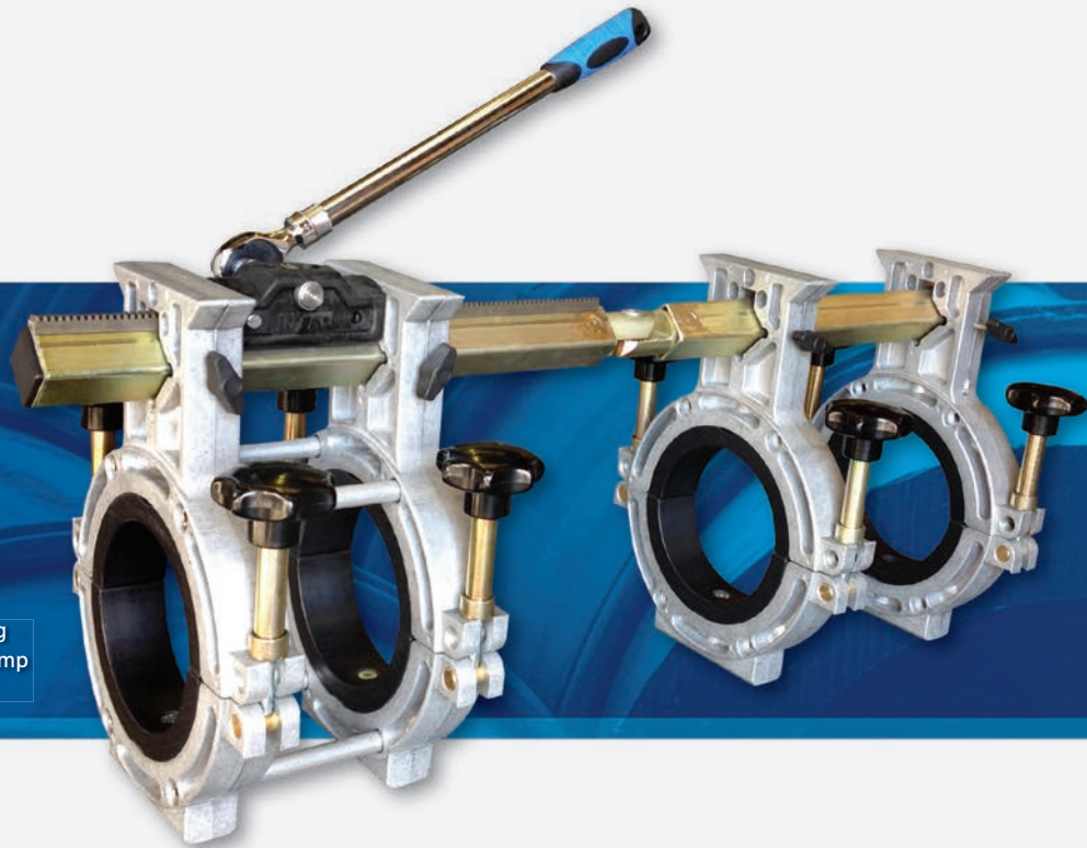
Mains Restraining Pull Together Clamp 63 - 200mm