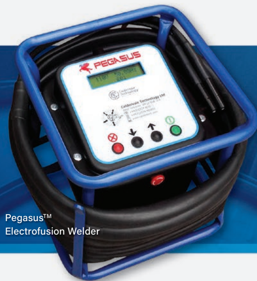
Pegasus™ Electrofusion Welder