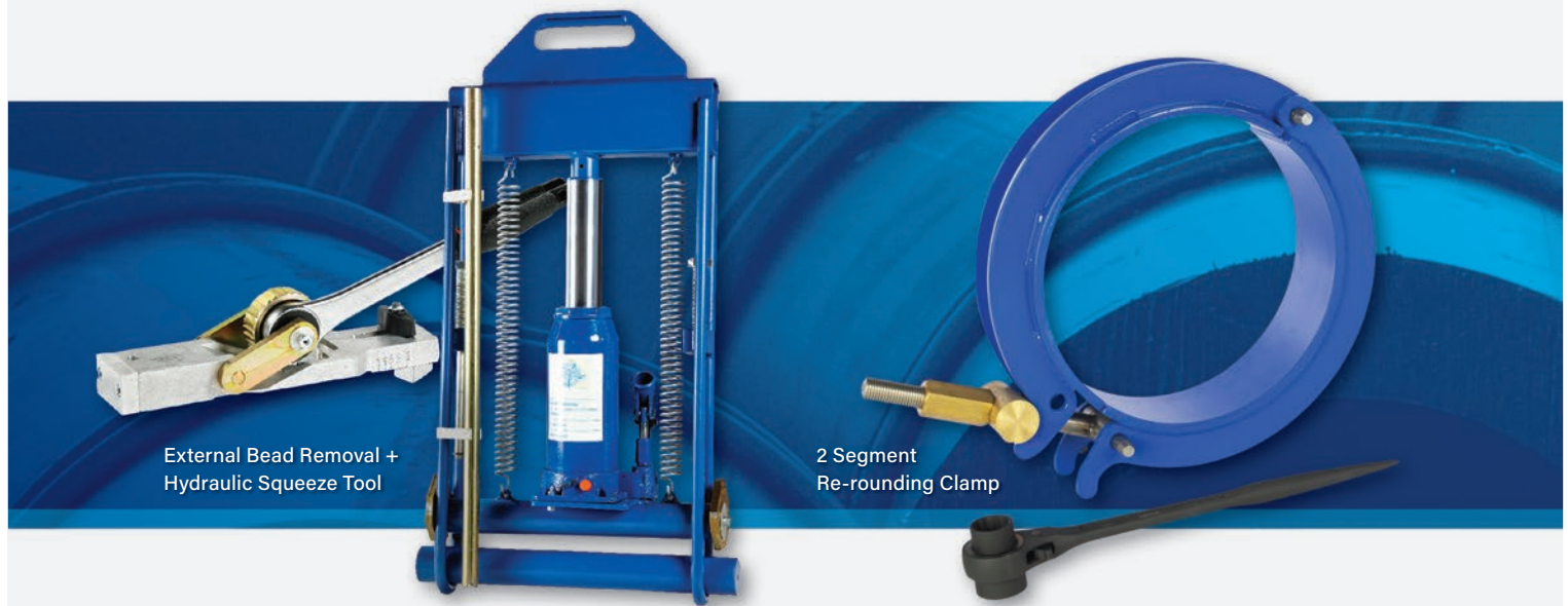
External Bead Removal + Hydraulic Squeeze Tool