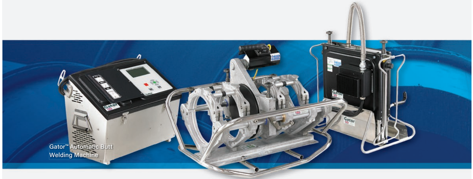
Gator™ Automatic Butt Welding Machine