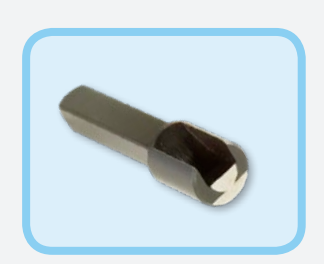
Single Point Scraping Tip