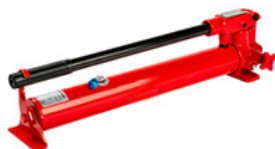
Hand pump assembly (hose not shown)