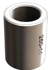
End stop (2 required per beam set)