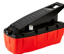
Air intensifier assembly (hose not shown)