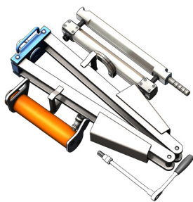
Basic squeeze tool kit without pump or stops